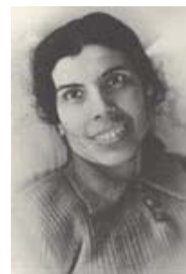
Blessed Alexandrina da Costa