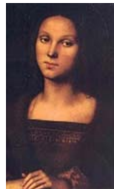
St Mary Magdalene -First woman mystic of the Church