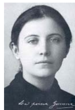
St Gemma Galgani - The extraordinary "Gem of Christ"