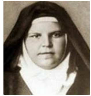
Blessed Mariam Baouardy