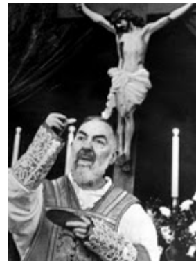
St Padre Pio