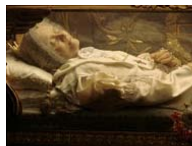
Blessed Anna Maria Taigi